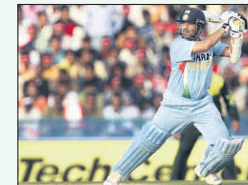
THREE RUNS SHORT: Sachin Tendulkar.

Vaughan said: "It looks that way and I am happy to do so. I have had a lot of success opening the batting for England and I don't see it being a massive change from batting at three."